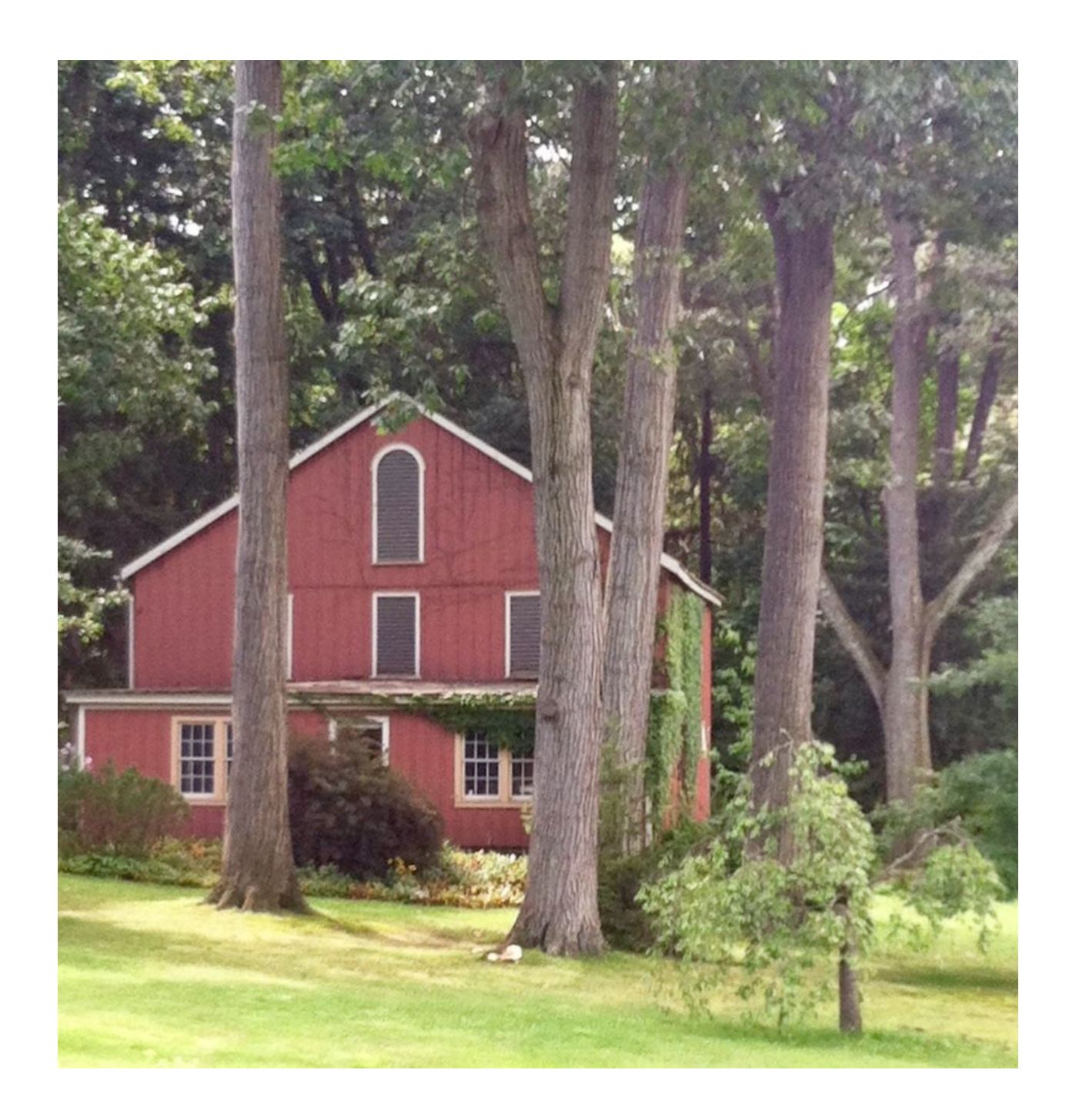
And an early Kelly Corners schoolhouse: