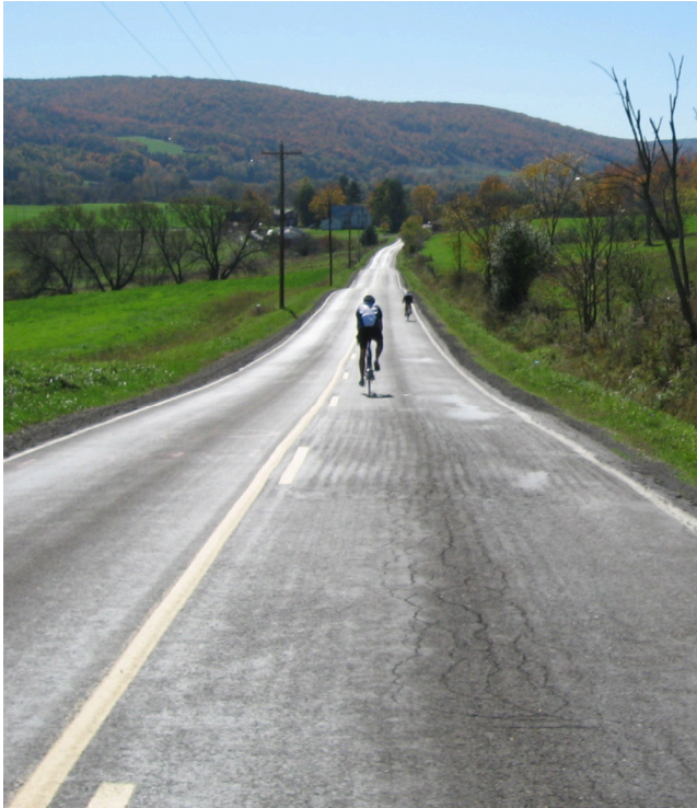
A ride in late October.