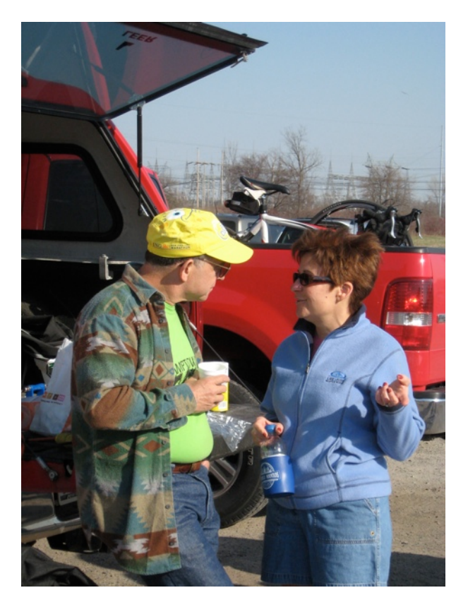
Earth Day Clean-up, last year.