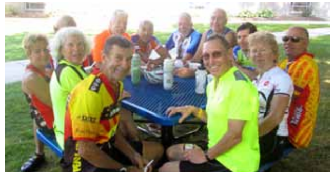
Group I (diff. location)