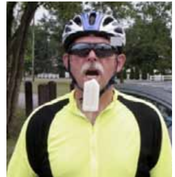
An accident occurred at one of the Slow-N-Easy rides. Some skin was lost, it wasn't pretty

That's all for now, Keep safe out there.