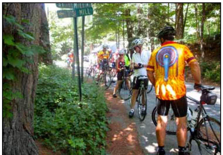
Yes, there is poison ivy in CT...