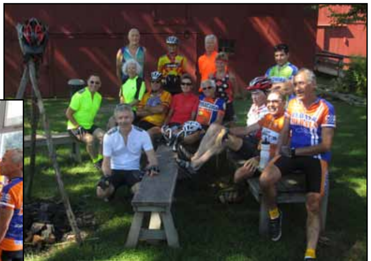
Road Group I