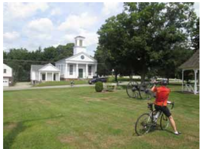
Scotland visit on a day of remarkably little traffic on shaded, windy country lanes.

I have a feeling that many of you who are reading this are saying - 'I'll have to sign up next year!' If you go, you won't be disappointed.