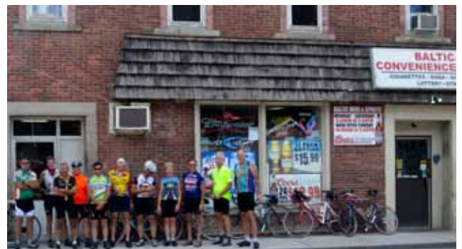
This Bud's for OCC. Baltic is a quaint little town on the way to Scotland.