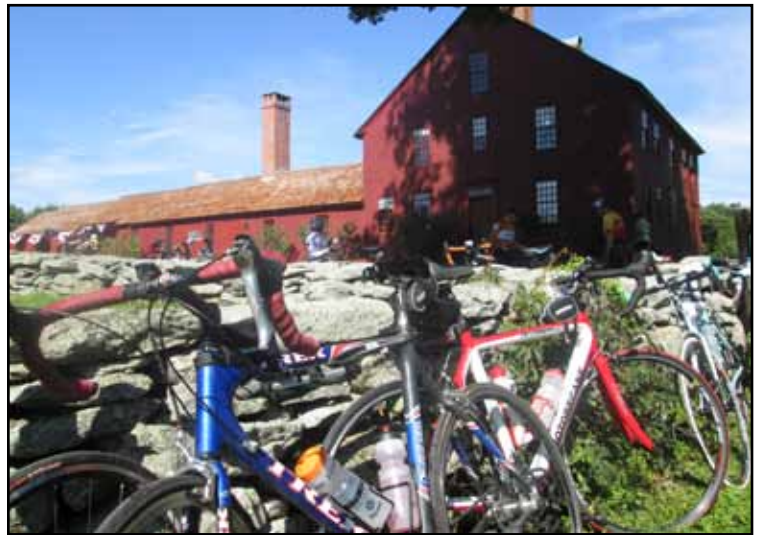
Nathan Hale homestead

UConn was founded as an ag school and a 1917 UConn Course Catalog refers to the Creamery and describes courses taught in Dairy Husbandry such as Milk Testing and Separation, Milk Production, Ice Cream Making, and Butter and Cheese Making.