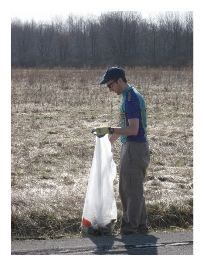
Earth Day Clean-up, last year.