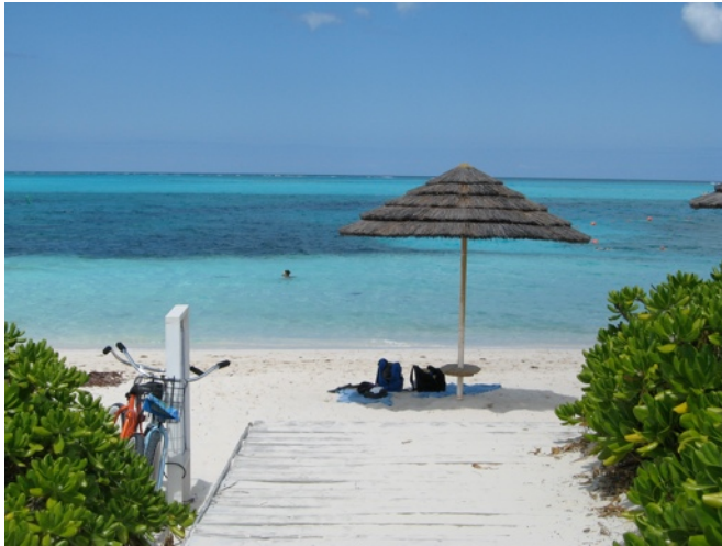
Providenciales, Turks and Caicos Islands