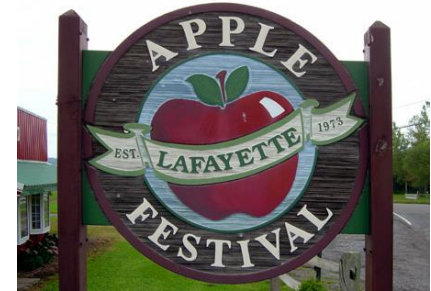
The Lafayette Apple Festival