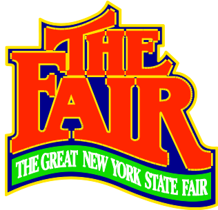
The New York State Fair