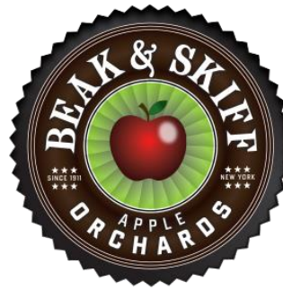
Beak and Skiff Apple Orchards and 1911 hard ciders