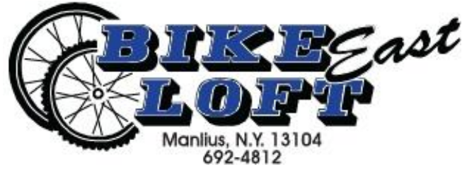
Neutral Race Support

We appreciate the support of our partners and sponsors: